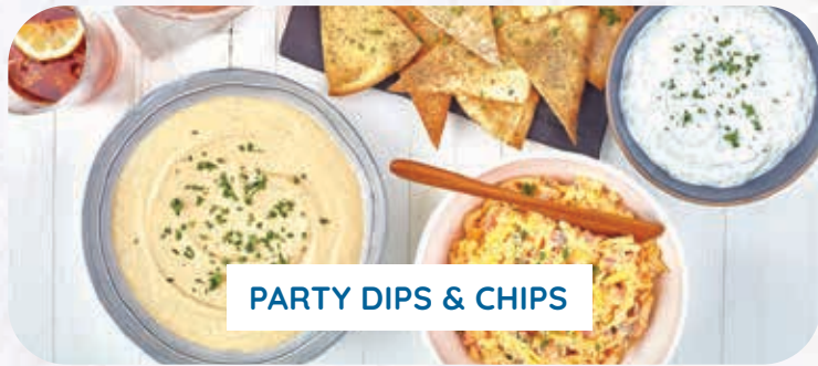
PARTY DIPS & CHIPS

Served in pints with 30 baked pita chips. May be served gluten-free upon request.